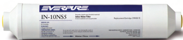
IN-10 NS5: EV9100-72