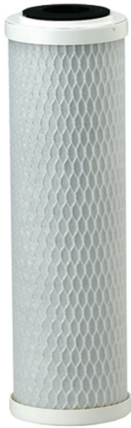
CG53-10 Replacement Cartridge: DEV9108-53