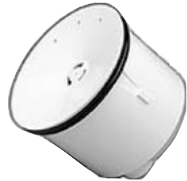
Cartridge only shown in picture.

Cartridge Kit Includes: Cartridge, Cartridge Key, Sealant Package, Protective Glove and Disposal Bag.